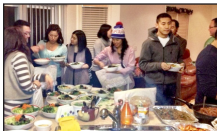
JANUARY BOM MEETING