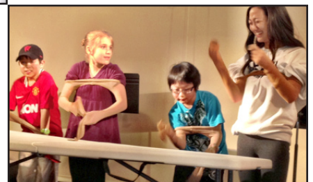
2013 NEW YEARS PARTY