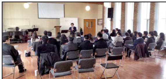
CONGREGATIONAL BIBLE STUDY